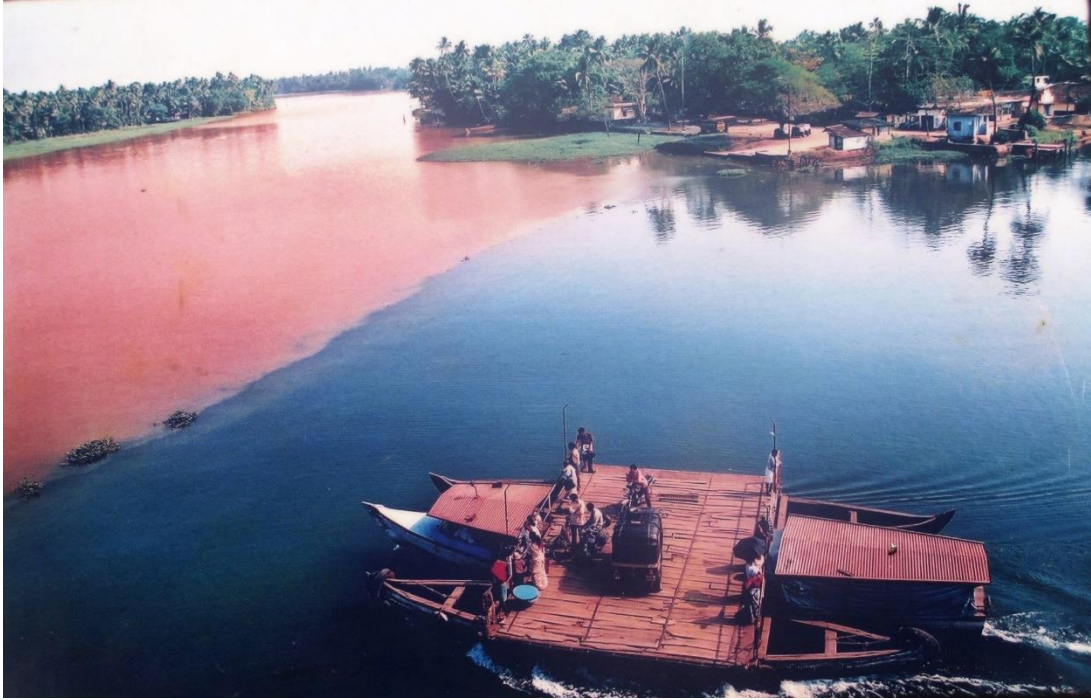
Figure 2: An image depicting the discoloration of River Periyar due to pollution.

An image (Figure 2) of River Periyar from 2005, taken by Sainudheen Edayar, soon became the symbol of industrial pollution in the region and helped in gaining legitimacy for the local fight against industrial pollution. The image represents the reality of pollution by focusing on the intersection of two stretches of River Periyar, one that flows through the industrial section and another. The stretch of River Periyar circling the industrial sector flows in a brick red color, whereas the other flows in green, reflecting the lush green landscape surrounding it. The images of River Periyar taken almost 15 years apart carry striking similarities in terms of the discoloration of the river water.