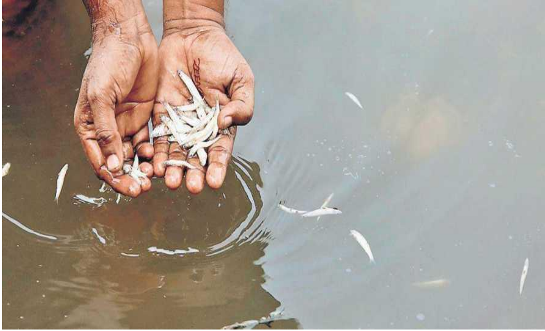
Figure 6: A person holding dead fish that float on the surface of the river due to pollution. Published in The New Indian Express , 9 April 2019.

the onset of monsoon, depletion of dissolved oxygen due to the dumping of organic wastes like seepage or a combination of these factors can be the possible reasons for fish kills. A detailed investigation is required to find out the exact reason of fish kill in the river Periyar before jumping into conclusions or pointing fingers. [Italics added]( Environment Cell, SCTU 2012: 3)