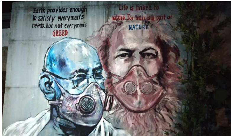
Figure 3: Graffiti portraying Karl Marx and M.K. Gandhi in industrial masks

in Kerala complicates preexisting readings and interpretations of labor-environmental conflicts. It shifts the discussion of labor-environmental conflicts from the realm of “red-green conflicts” to that of “red-red conflicts,” where both movements declare their ideological affiliations to Marxism.