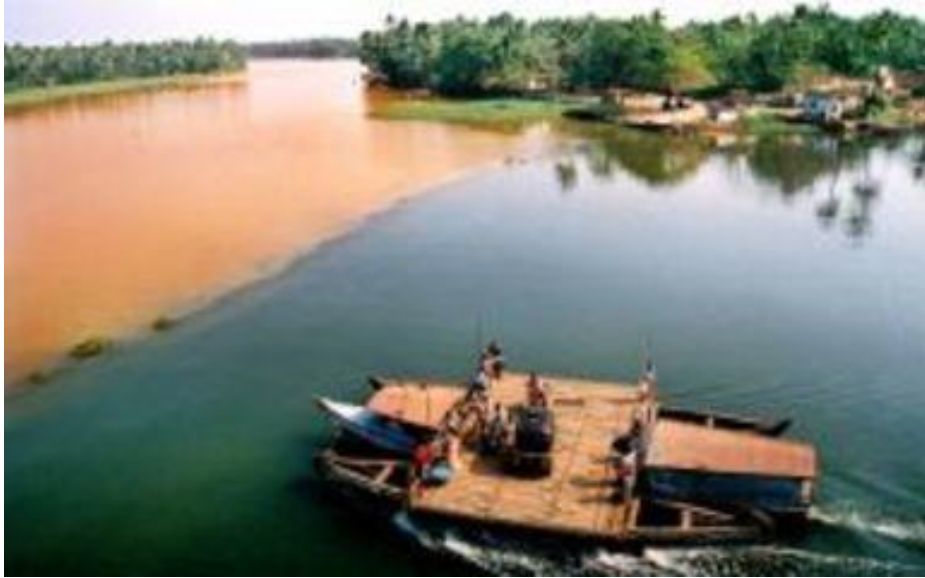
Figure 4: An aerial image of River Periyar flowing in Different Colors

was running in 365 colors in 365 days and that's when we decided to jump in and do something to stop this", commented Maqbool a green activist when asked about the many shades of the river.