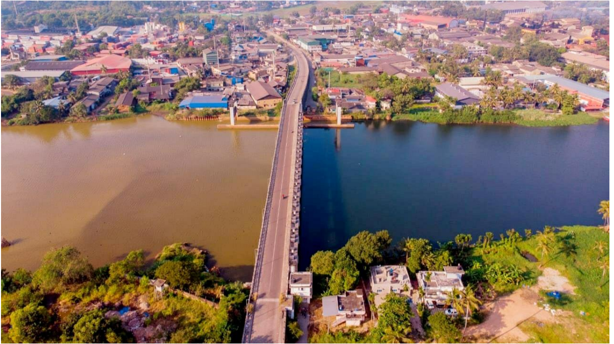
Figure 1: River Periyar flowing in two different colors on either side of Pathalam bridge near Eloor, Ernakulam. Published in Metro Manorama , July 10, 2020

On January 10, 2002, a newspaper supplement published in the Kochi edition of a leading Malayalam newspaper, Metro Manorama , carried the image of the River Periyar with the title, “As the river burns, the land weeps.” The image published on the front page of the supplement was accompanied by a feature highlighting the issue of pollution and reduced oxygen supply in the river. The image depicted River Periyar, the longest river in Kerala, flowing in two different colors on either side of the Pathalam regular-cum-bridge in the Eloor-Edayar industrial region. The image was reposted and shared widely on Facebook, and one such post pasted the new image alongside an old photograph of the river.