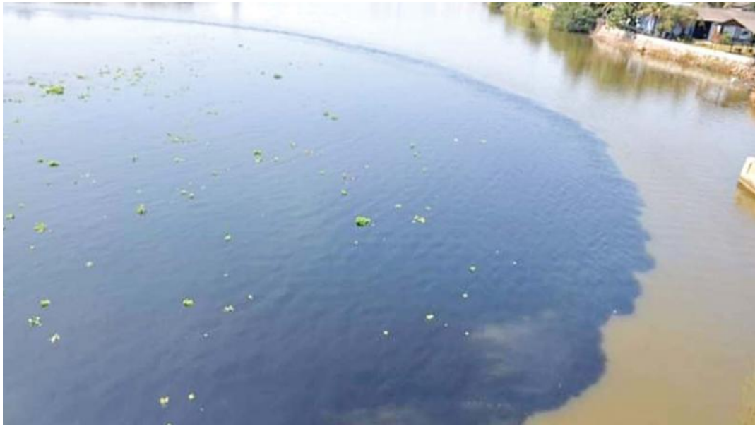
Figure 5: Industrial Effluents spreading across the river water

the distribution of free-drinking water to the local people, the environmental movement has accomplished many positive outcomes in the region. However, despite these substantive changes, the river continues to flow in many colors and the green activists attribute this to the release of untreated effluents into the river through hidden discharge pipes installed by the industries. The photograph attached below was published by Deccan Chronicle a newspaper (printed in English) that reported the changing color of the river and massive fish-kills on April 9, 2019.